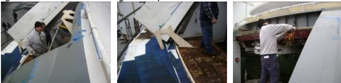
1. Cutting Section of aft for fitting of templates for aft door*