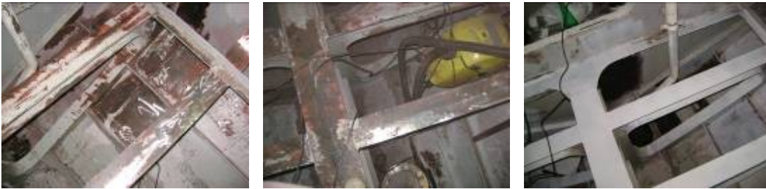
3. Preparation for Crew mess and tank top first coat Danboline*