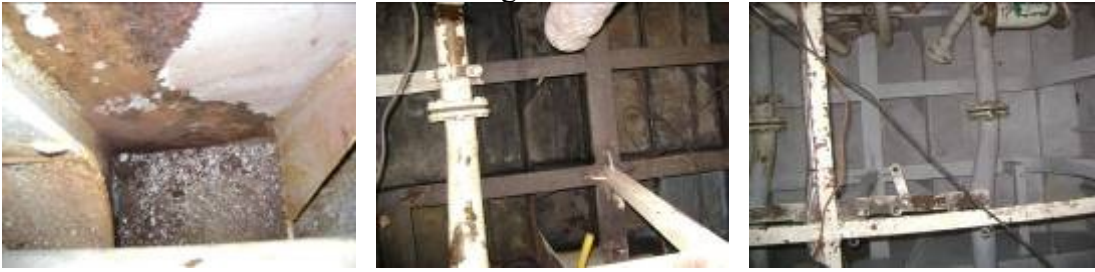
2. Boiler room Bilge additional rust removal and priming*